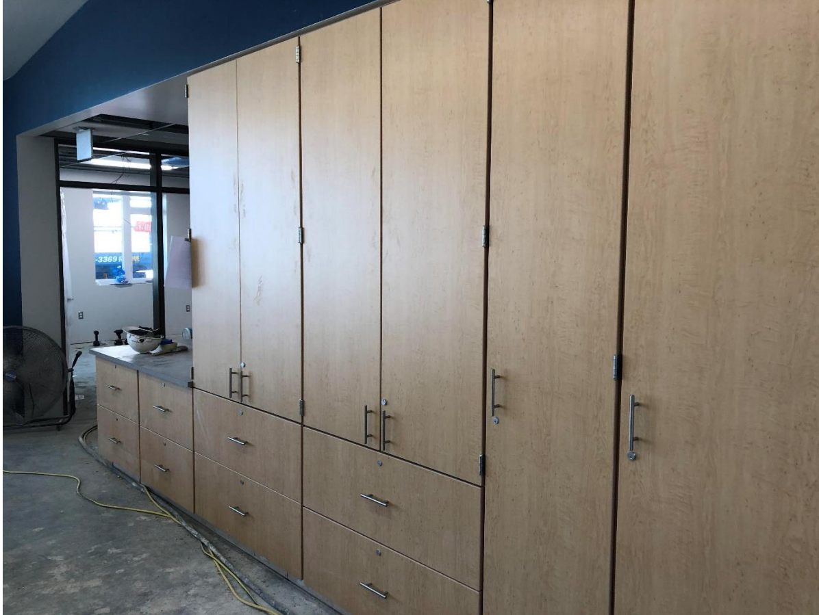
LHHS OFFICE CASEWORK