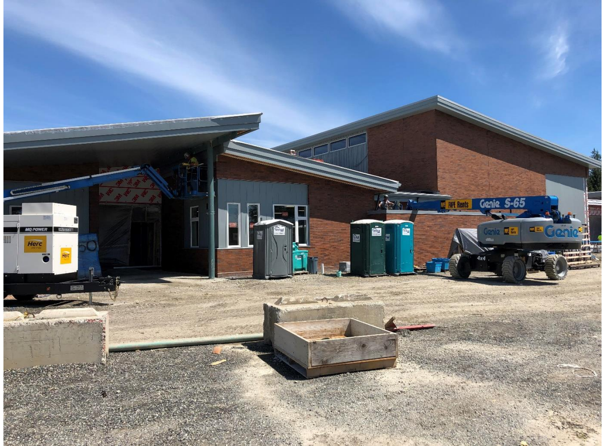
SARATOGA WEST SIDE OF BUILDING