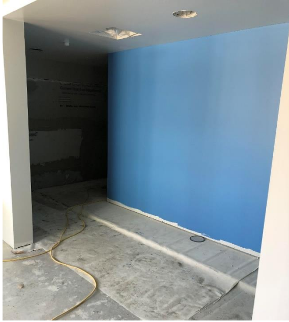
SARATOGA RESTROOM ENTRY