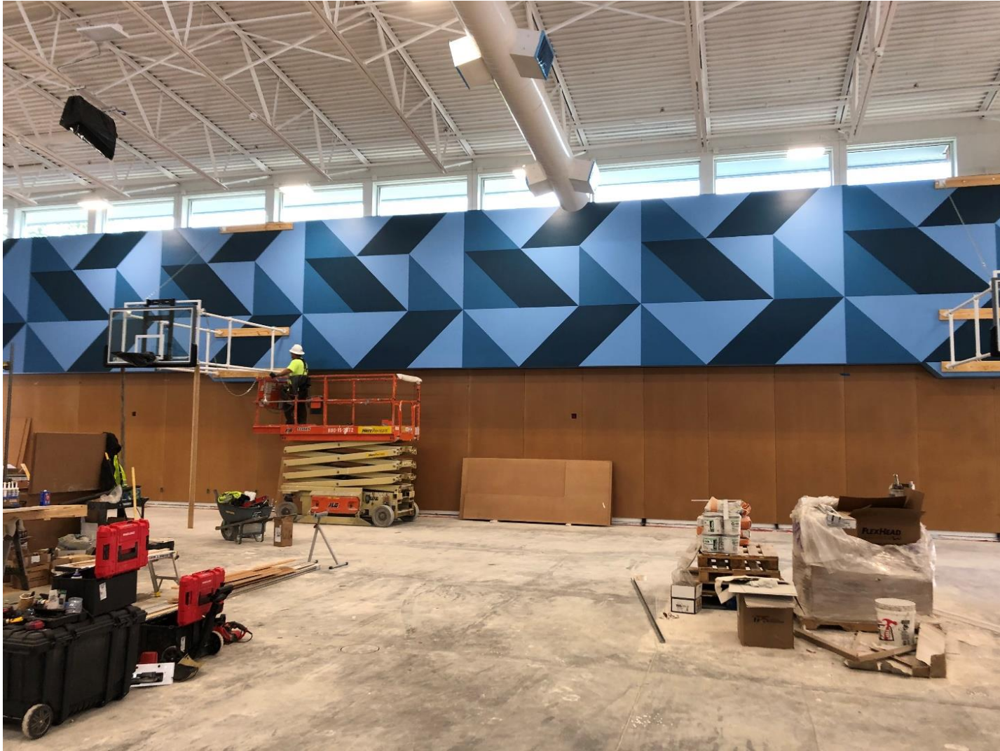
GYM FLOOR READY TO BE INSTALLED. UPPER WALL TRIM INSTALLED.