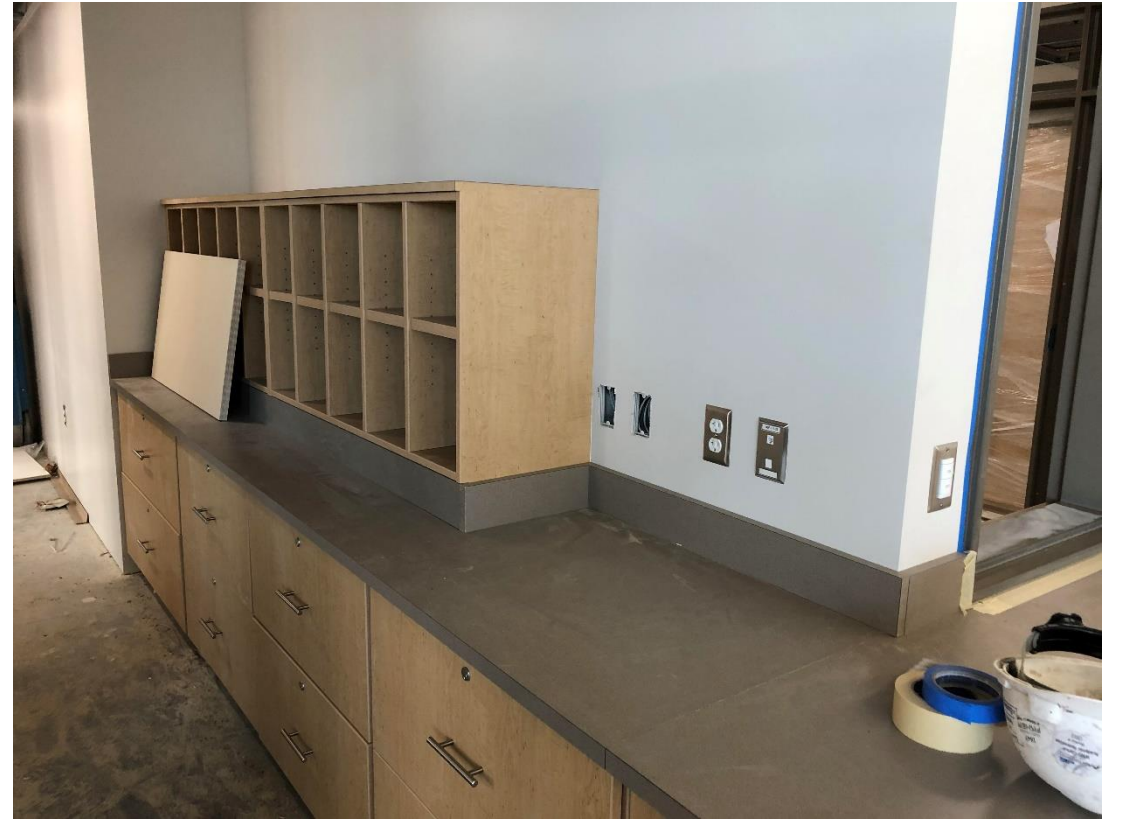
LHHS STAFF BOXES