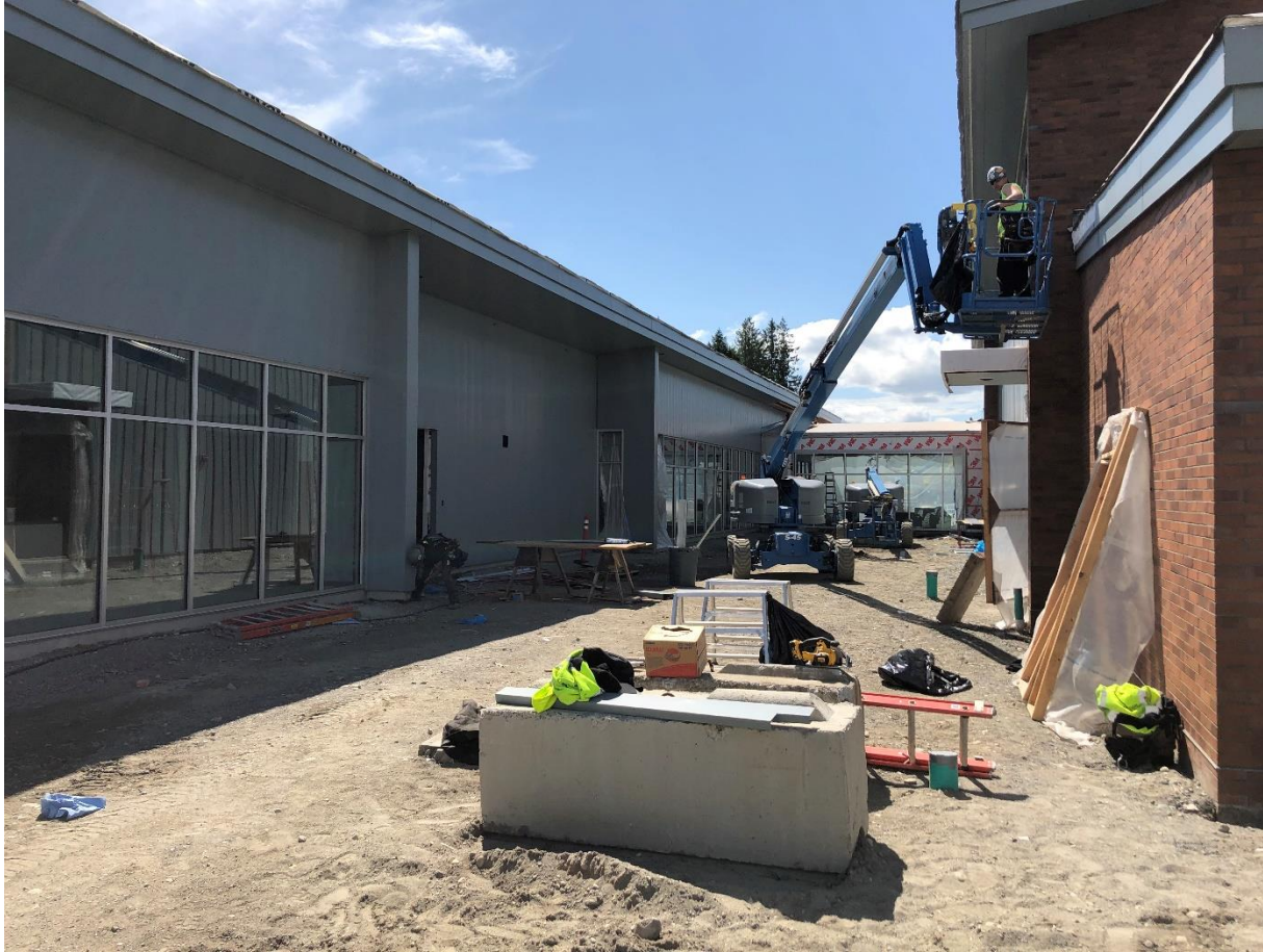
COURTYARD BETWEEN LHHS/SARATOGA