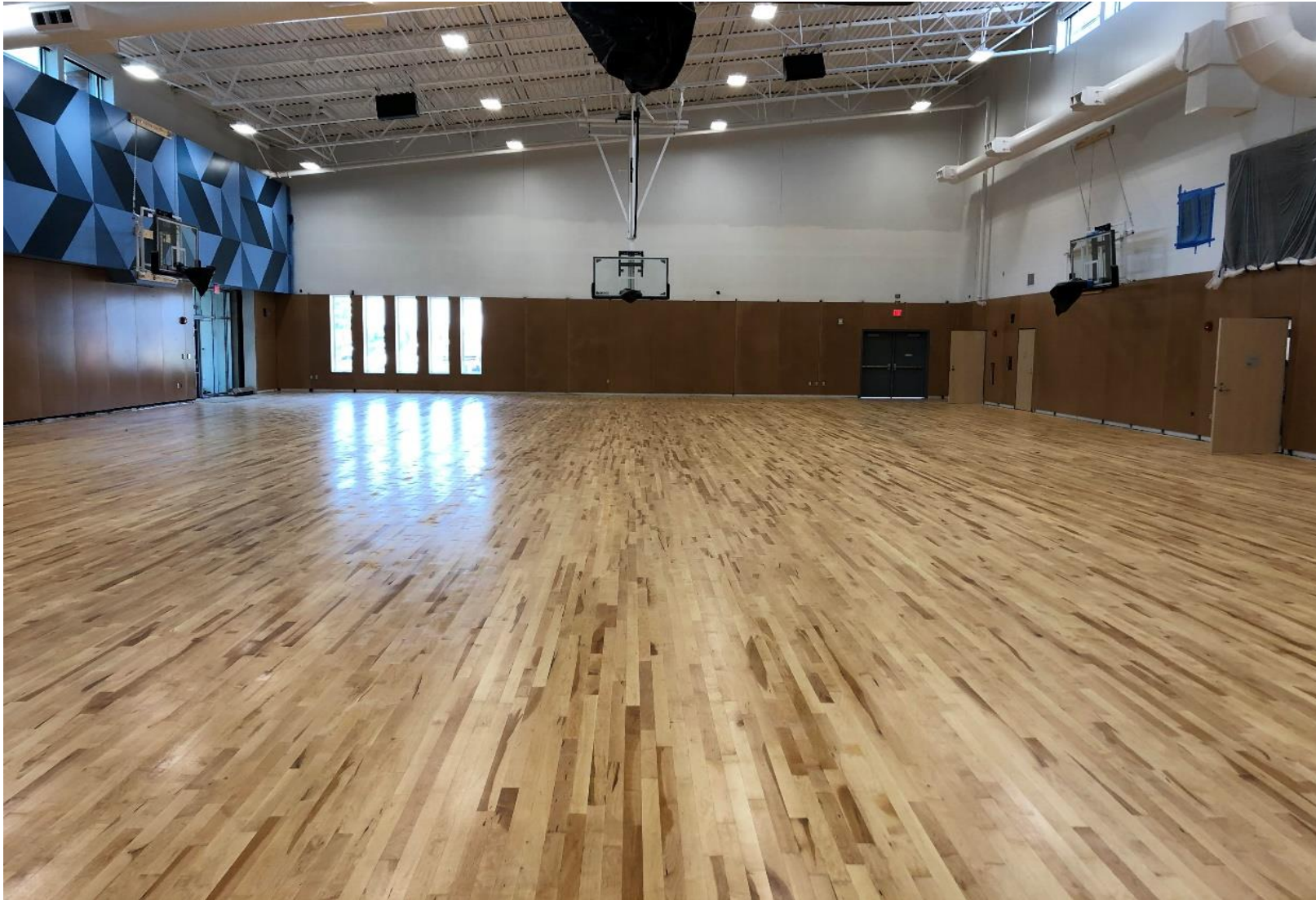
GYM FLOOR – PREP FOR STRIPING