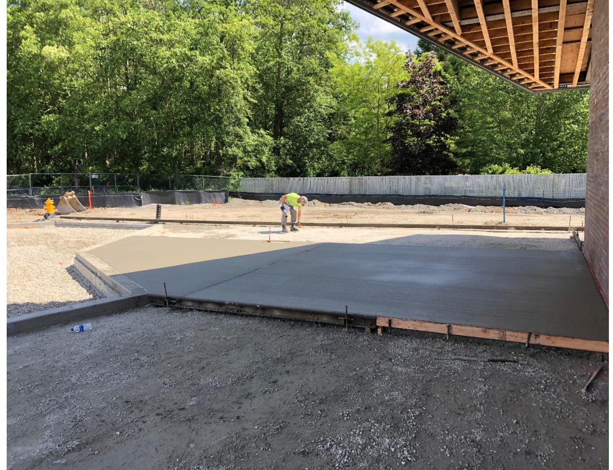
PLAZA EAST SIDE OF SARATOGA