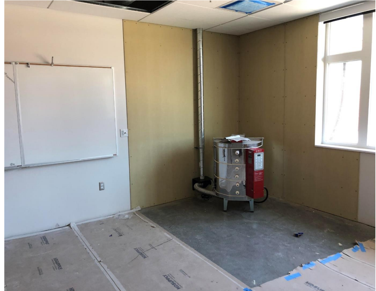
KILN IN ART ROOM