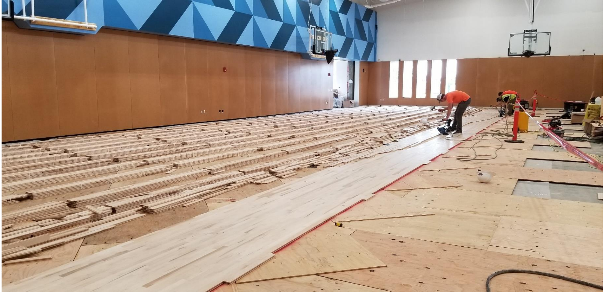
GYM FLOOR BEING INSTALLED