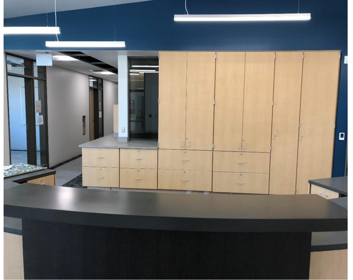
LINCOLN HILL OFFICE AREA