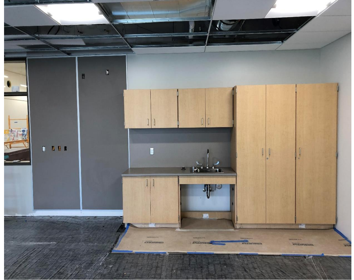
TYPICAL LINCOLN CLASSROOM