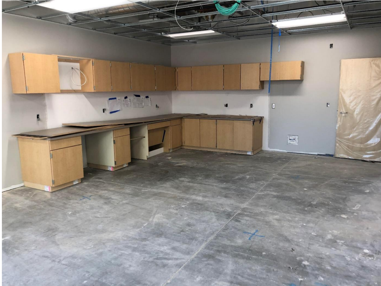
CCC STAFF ROOM