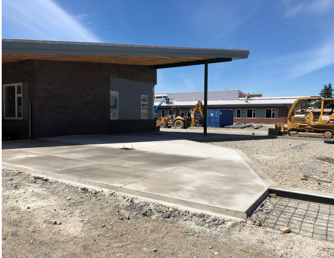
SARATOGA PLAYGROUND AREA