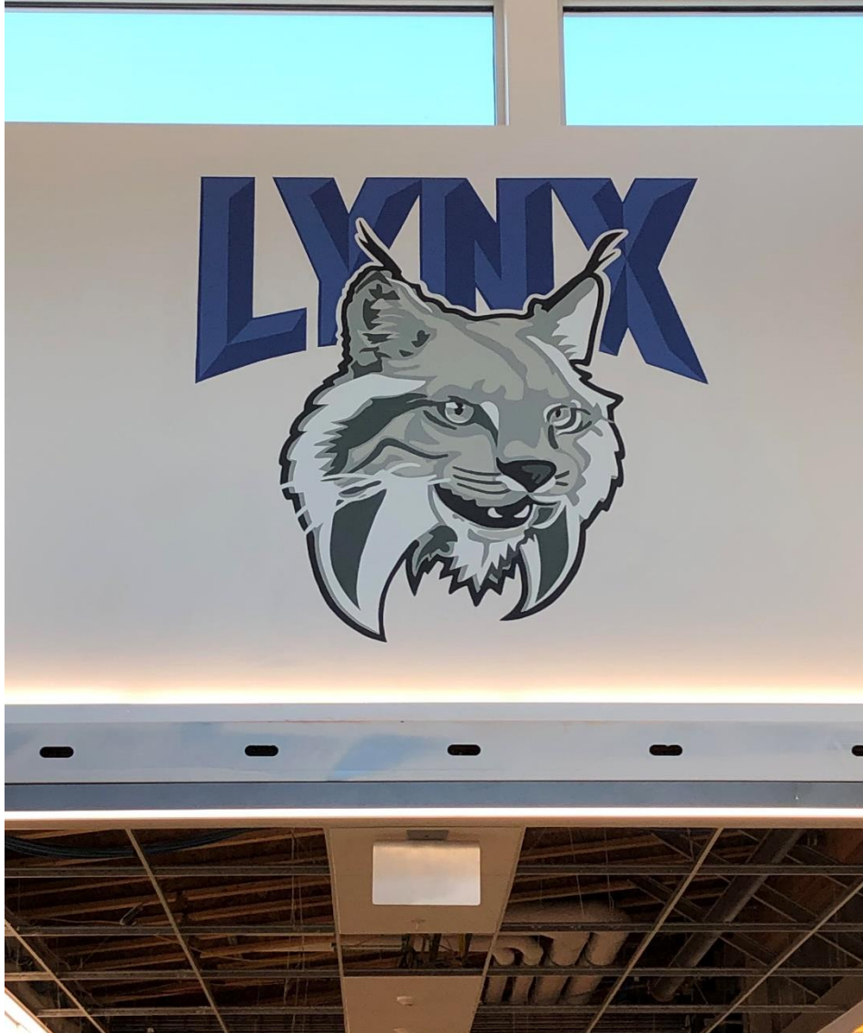
LINCOLN HILL ENTRY GRAPHIC