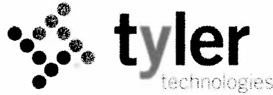
Exhibit A Investment Summary

The following Investment Summary details the software and services to be delivered by us to you under the Agreement. This Investment Summary is effective as of the Effective Date. Capitalized terms not otherwise defined will have the meaning assigned to such terms in the Agreement.