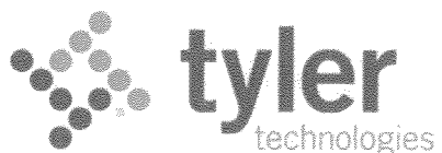
Exhibit C Schedule 1 Support Call Process