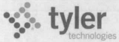
Exhibit D Third Party Terms

REMAINDER OF PAGE INTENTIONALLY LEFT BLANK