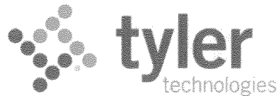
Exhibit C Service Level Agreement