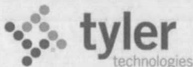
Exhibit B Invoicing and Payment Policy

We will provide you with the software and services set forth in the Investment Summary of the Agreement. Capitalized terms not otherwise defined will have the meaning assigned to such terms in the Agreement.