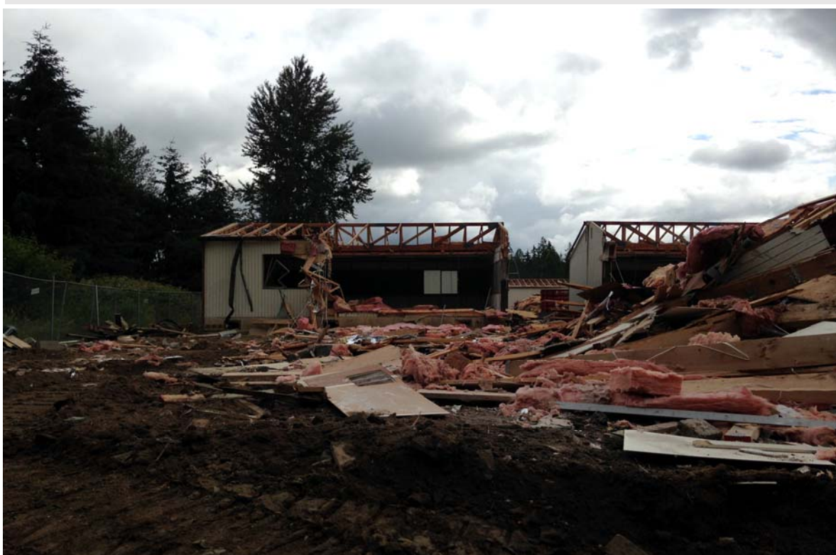
6/28/18 Portable demo progress. Debris is loaded into a mixed waste container and taken off site to be sorted.