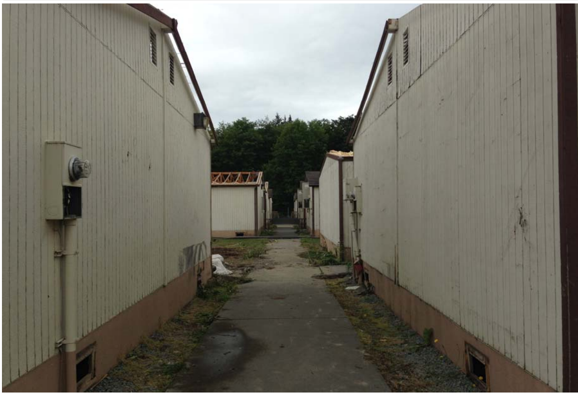
06/23/18 Portable demo begins.