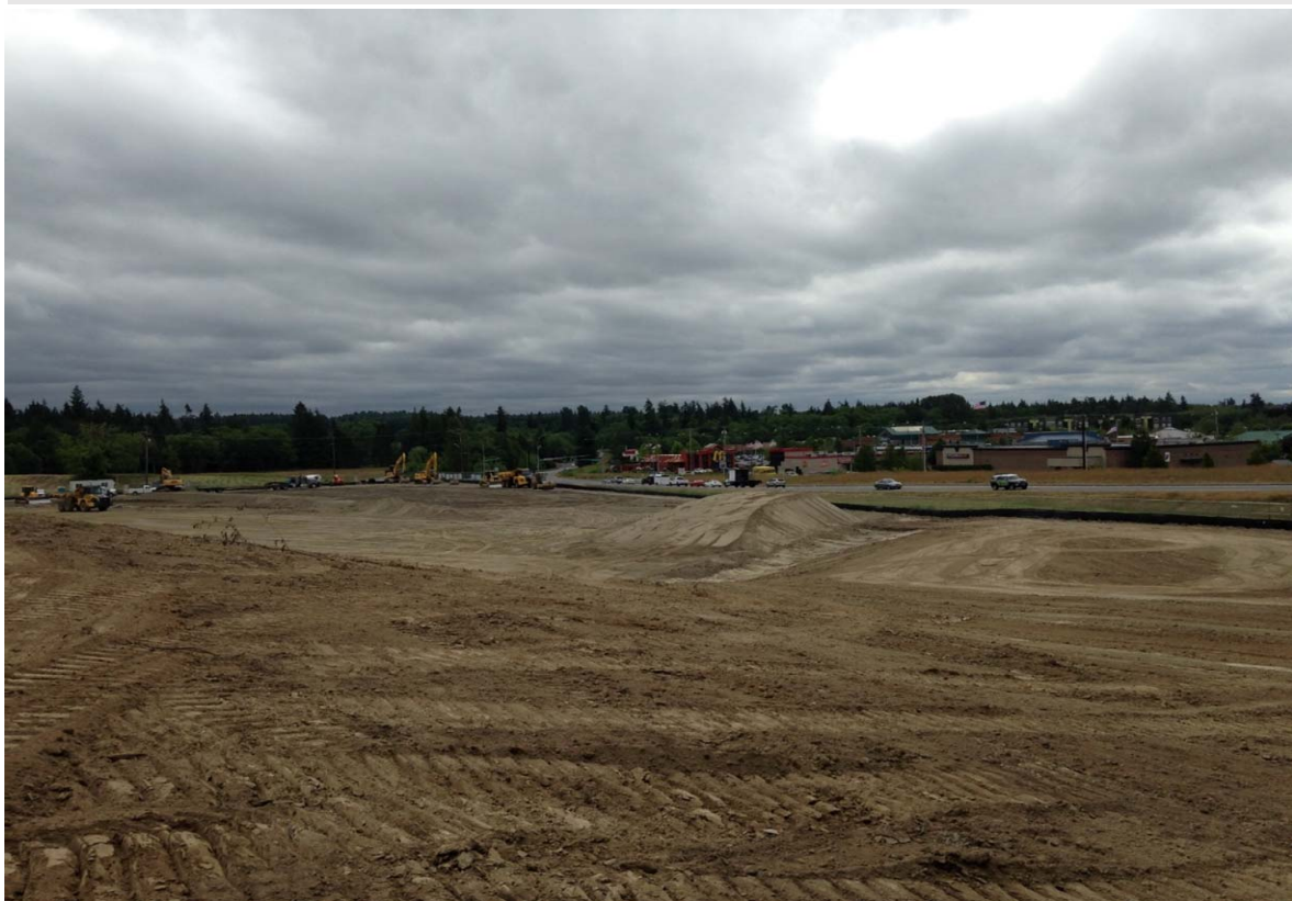
6/21/18 Contouring of the site in progress. Drainage material from the old baseball fields is being stockpiled for use as utility backfill.