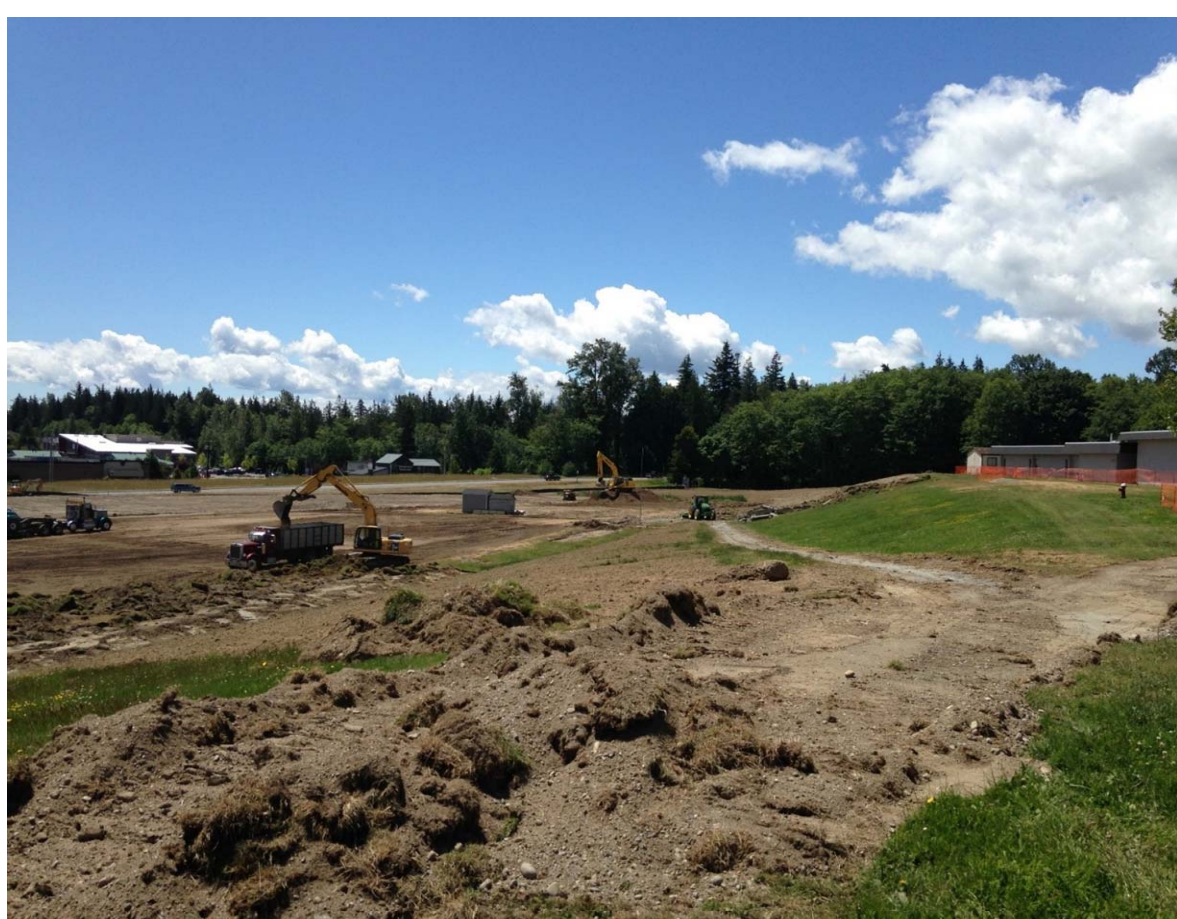
6/11/18 TayEx is stripping sod and topsoil from the site for Lenz to haul away.